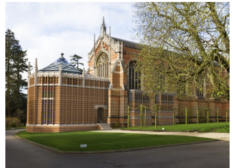
Radley College Chapel extensions.