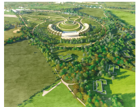
The "Mullin" Motor Museum at Enstone Airfield